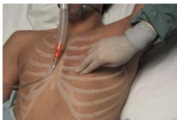
Figure 1. Locating Landmarks.

Position the patient in either a supine or a semirecumbent position. Maximally abduct the ipsilateral arm or place it behind the patient's head. The area for insertion is approximated by the fourth to fifth intercostal space in the anterior axillary line at the horizontal level of the nipple. This area corresponds to the anterior border of the latissimus dorsi, the lateral border of the pectoralis major muscle, the apex just below the axilla, and a line above the horizontal level of the nipple—often referred to as the “triangle of safety.” 2 You can isolate this area by palpating the ipsilateral clavicle, then working downward along the ribcage, counting down the rib spaces. Once the fourth to fifth intercostal space is felt, move your hand laterally toward the anterior axillary line (Fig. 1). This is the area for incision; the actual insertion site should be one intercostal space above the chest-tube incision site. Mark the spot for incision on the skin with a pen or the back of a needle.